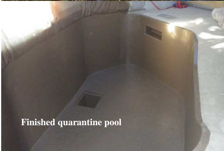
Finished quarantine pool