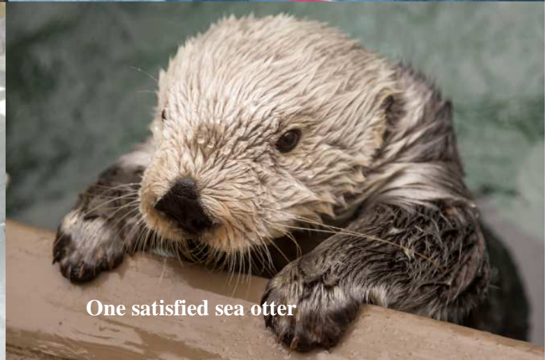
One satisfied sea otter