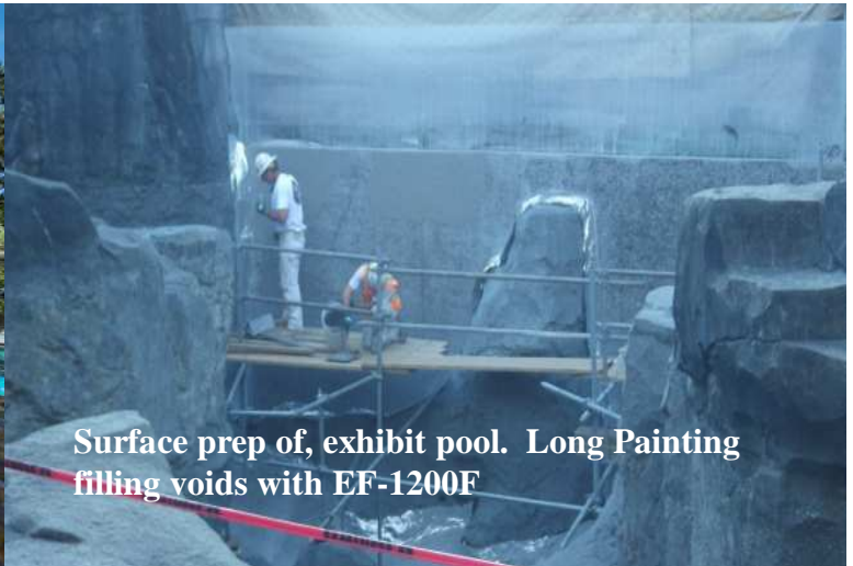
Surface prep of, exhibit pool. Long Painting filling voids with EF-1200F